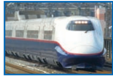
Nagano Shinkansen "ASAMA"