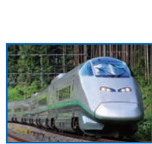
Yamagata Shinkansen "TSUBASA"