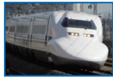
Tokaido & San'yo Shinkansen "HIKARI"

San'yo Shinkansen (622.3 km) Train Names: NOZOMI, MIZUHO, HIKARI (incl. HIKARI Rail Star), SAKURA, KODAMA