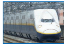
Tohoku & Joetsu Shinkansen "Max"

Tohoku Shinkansen (713.7 km) Train Names: HAYABUSA, HAYATE, YAMABIKO, NASUNO, Max-YAMABIKO, Max-NASUNO