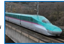
Tohoku Shinkansen "HAYABUSA"