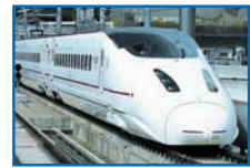
Kyushu Shinkansen "Series 800"

*Hayabusa begins operation on March 5, 2011 *Mizuho and Sakura begin operation on March 12, 2011 *Gran Class (Facilities) will be connected starting March 5, 2011