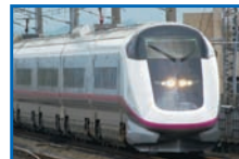
Akita Shinkansen "KOMACHI"