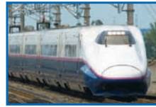
Tohoku Shinkansen "HAYATE"