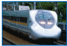
San'yo Shinkansen "HIKARI Rail Star"